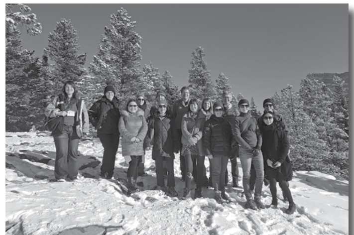
Happy hikers at the top, Tunnel Mountain excursion