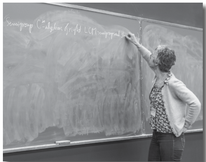
Nadia Larsen speaking on semigroup C^* -algebras