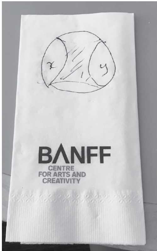
Research on napkins really does happen

Most of the workshop was spent working in these small groups, but on Monday and Friday each small group gave a ten minute presentation to all participants on their project and progress.